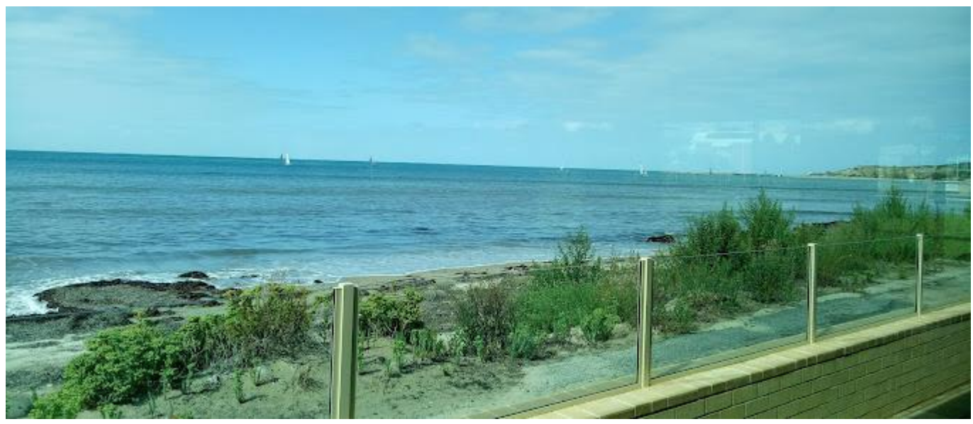
VIEW FROM THE VICTOR HARBOR GREENS